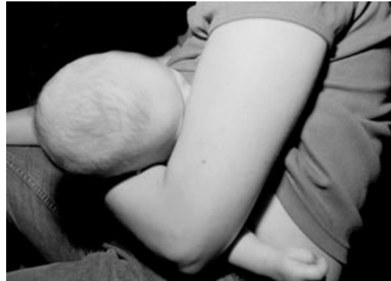
When it comes to nursing in public, does discretion matter?